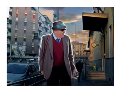
Figure 2. Exemplary images of potential applications of CURVACE as sensors integrated in flying microrobots for vision-based navigation (left) and vision-based collision-alert system for visually impaired people (right).