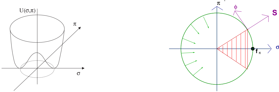
Fig. 1. Left panel: Mexican hat effective potential. Right panel: Chiral circle corresponding to the bottom of the mexican hat potential

confinement dynamics. A totally different view is provided by the constituent quark picture where the nucleon is made of three "big" quarks ( i.e. , of the NJL type) getting their mass from the chiral condensate of the non perturbative QCD vacuum. A plausible hybrid picture mixing both aspects seems to be supported by lattice calculations [3]. The nucleon looks like a Y shaped color string with three constituent quarks attached at the end-points of the Y . The introduction of a coupling between quarks and mesons allows to build the pion cloud which plays an extremely important role to account for the mass and the chiral properties of the nucleon (such as the sigma term or chiral susceptibilities defined below). Finally possible configurations where a string develops between one quark and one diquark in the color antitriplet channel, might also be present in the nucleon.