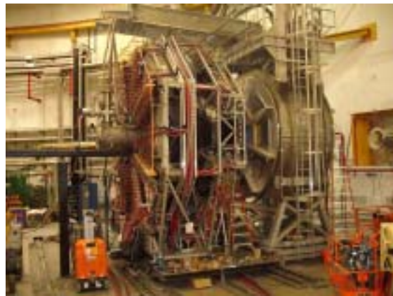
Fig. 1. Photograph of the the G^0 set-up installed in Hall C in its “backangle” mode.

Part of a worldwide program, the G^0 experiment is carried out in Hall C of Jefferson Laboratory by a large collaboration of scientists from institutions in the United States, Canada, France, Armenia and Croatia. The ultimate goal of G^0 is to provide data to allow a comprehensive and precise map of the neutral weak form factors of the proton over the range of momentum transfers 0.1-1.0 (\text{GeV}/c)^2 . This is done by measuring PV asymmetries in the scattering of polarized electrons on hydrogen and deuterium targets. To allow a separation of the different contributions (electric, magnetic, axial), the G^0 experimental program is now performing its backward angle measurements. In the coming months, it will provide results for two Q^2 values, 0.23 and 0.62 (\text{GeV}/c)^2 . During these measurements, with