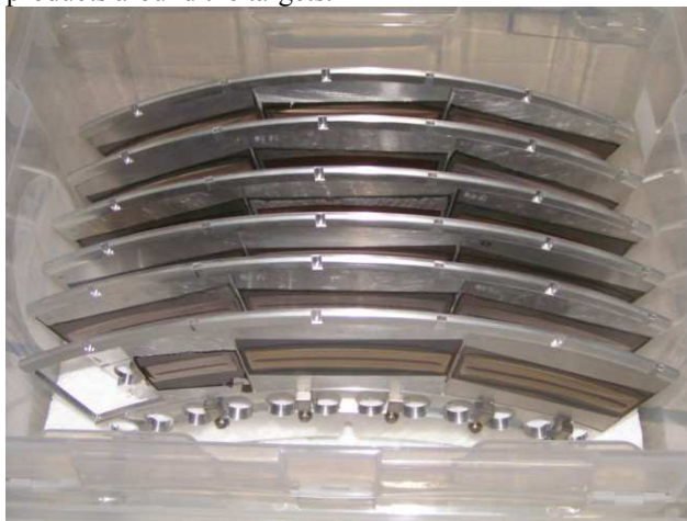
Figure 4: ^{208}\text{Pb} targets on segments of the wheel after irradiation.

A first test irradiation with a ^{58}\text{Fe} beam on ^{208}\text{Pb} took place in order to produce isotopes of hassium ( Z=108 ) and reproduce the known the excitation function from the GSI [4]. ^{208}\text{Pb} targets rotating at 1500 rpm were then irradiated for nearly three weeks with a ^{76}\text{Ge}^{10+} beam of 5 MeV/u at 0.8\ \mu\text{Ap} (average). The power dissipated in the targets was 6 W. The integrated beam was 5 \cdot 10^{18} particles. Meanwhile, we replaced the targets every five days. The target quality and the synchronization between the beam pulses and the wheel rotation were continuously monitored with a silicon surface barrier detector measuring scattered particles and a \text{BaF}_2 crystal detecting the \gamma -rays of the reaction products around the targets.