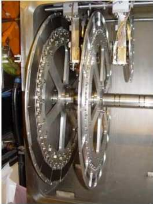
Figure 1: Target chamber with the two wheels bearing 18 Pb or Bi targets and 18 carbon charge equilibration films.

To help with the heat dissipation problem, the target material is deposited onto mechanically strong heat conducting layers of 35 \mu\text{g}/\text{cm}^2 of carbon. A thin protective layer of about 5 \mu\text{g}/\text{cm}^2 of sublimed carbon covers the target surface in the downstream direction to reduce sputtering loss. So for the above-mentioned experiments, two wheels, with a diameter of 670 mm, bearing either 36 short or 18 long targets were mounted on a common axis to rotate together at 2000 rpm. Targets are mounted on the upstream wheel and carbon foils for charge equilibration on the other one (see Figure 1).