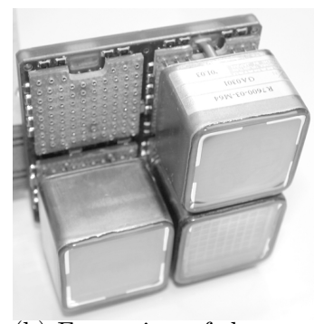
(b) Front-view of the prototype EC, with three of the MAPMT installed.

apparatus has to be compatible with the requirements imposed by a Space mission including: mechanical robustness and compactness, resistance to environmental factors (including radiation, chemical contamination and thermal excursions), high reliability and low ageing.